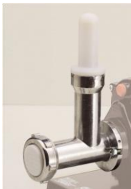
PASTA PRESS 8400 N