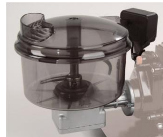
MIXER 8300 N

REBER - Via Valbrina, 11 - 42045 Luzzara(RE) - ITALIA