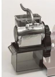
GRATER 8900 N