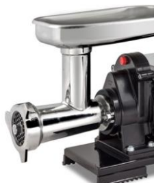
MEAT MINCER 8800 N - NC / 8830 N 8800 NI - NP / 8830 NI